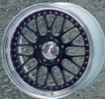
Surcharge paint center black Part.-No.: CAR5130BLACK

A cargraphic stainless steel centercap is included or optional for a high tech finishing touch opt for a set of cargraphic center lock dummies.