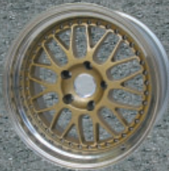
Surcharge paint center gold Part.-No.: CAR5130GOLD