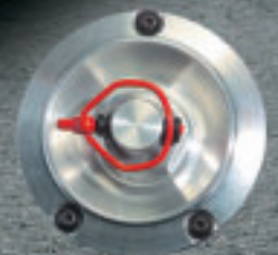
Center lock dummy Part-No.: CAR41910050

cargraphic wheels are the absolute finest 3 piece wheels on the market. This 3 piece high quality product "Made in Germany" incorporates the strongest, lightest and most durable components such as: • Heat treated cast stars or, • Spun forged machined stars, • Handpolished stainless steel outer rims, • Reinforced inner rims, • Internal bead retainer for secure and perfect tire fit as prescribed by TÜV standards, • Stainless steel bolts. Race proven on the worlds most challenging race tracks the cargraphic RACING wheel is the world record holder on the Nürburgring Nordschleife. All wheels are TÜV approved with extreme high wheel loads, thereby insuring the highest quality and construction. The wheels are available in the following finishes: standard: silver center; custom: black center, SLC-chrome center, painted in any colour.