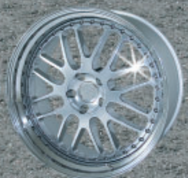
Surcharge polish center Part.-No.: CAR5130POLISH