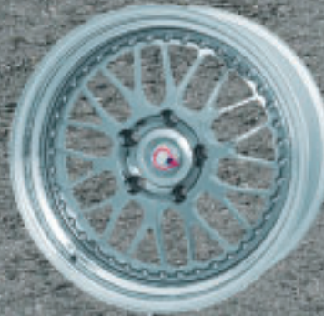
Surcharge center SLC-chrome Part.-No.: CAR5130SLCCHROM