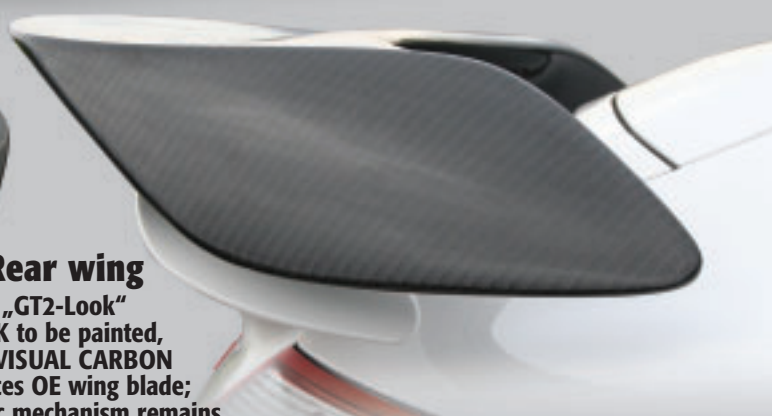
Rear wing „GT2-Look“ GFK to be painted, or VISUAL CARBON replaces OE wing blade; hydraulic mechanism remains Part-No.: NP97T050GFK Part-No.: NP97T050KEV